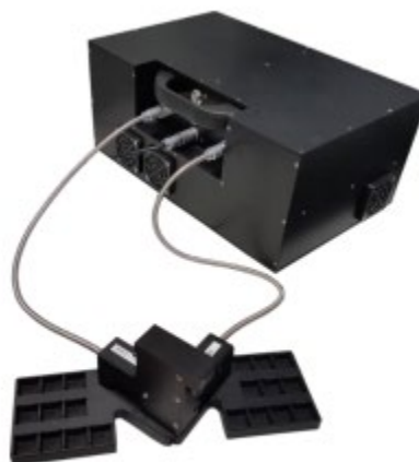
Lab on the Go with Stationary Optical Reader

The Lab on the Go has been adapted to read viruses whereby the quantum biosensor is suspended in liquid within a test tube and mixed with the swab sample from a surface collection or saliva sample. The collection and mixing tube is of high quality optical plastic and is placed either in a stationary or handheld reader as shown in the two images below: