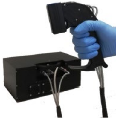
Lab on the Go with Handheld Optical Reader

It is planned to achieve regulatory approval for testing humans for viruses as part of the early warning pandemic system. The early testing and validation results have been reviewed by the FDA in the USA in August of 2022 and our core technology development partner is developing the full validation report for the FDA to achieve either EUA approval or a full De Novo 510K approval, this has not been determined based on the EUA availability when the validation report is completed.