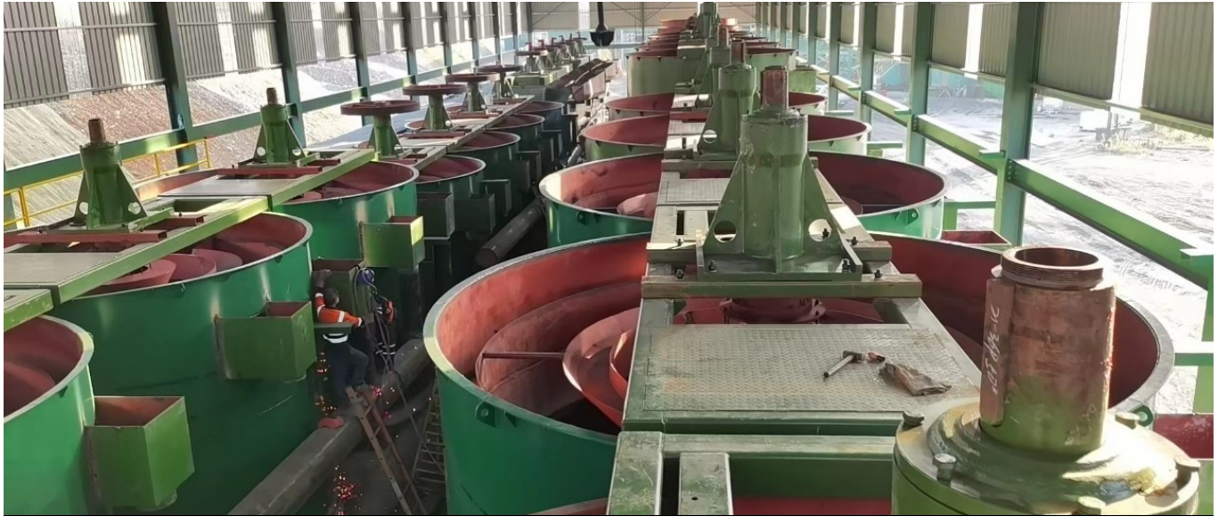
Acidspars Flotation Manufacturing System

The Company recently closed a $10,500,000 USD financing, to build its second and largest plant – a flotation facility designed to produce acidspars. Acidspars sells for a premium in the fluorspar market due to the extensive number of industrial applications.