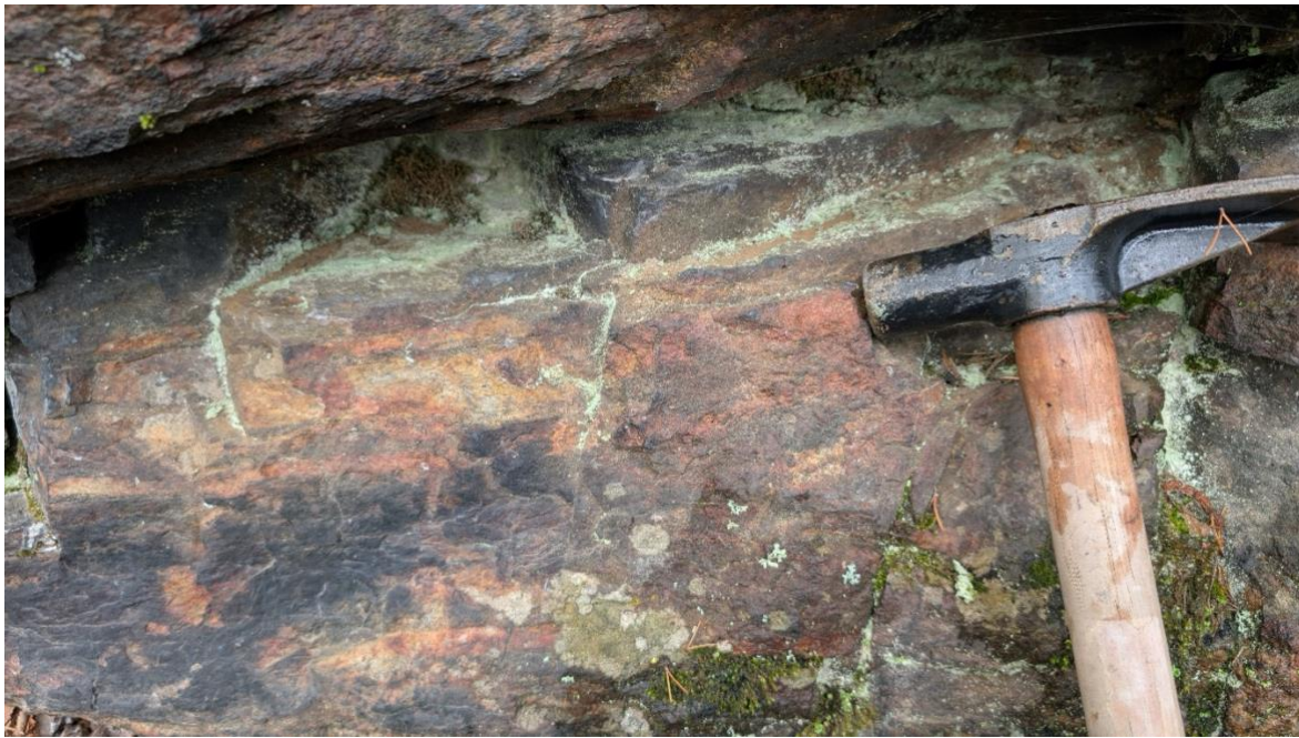
Figure 4. Oxidized metasediment outcrop with hematite and limonite alteration