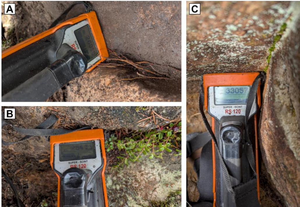
Figure 2. Investigation at SMDI showing 5781 (13V 416713 E, 6274629 N) returned strong radioactivity across an area of 35 m. Scintillometer readings ranging from: A) 26,900 cps, B) 25,400 cps, and C) 33,000 cps.