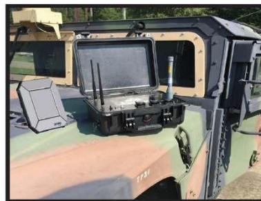
SENTINEL—FULL FEATURED PROTOTYPE

The SENTINEL technology developed and marketed by a management team focused on becoming the leader in emergency communications and operation support services. With over two decades of combined experience in wireless communications, integration of voice, video, data technologies, and emergency/disaster response program management, our management is positioned to solve technical problems with world-class solutions.