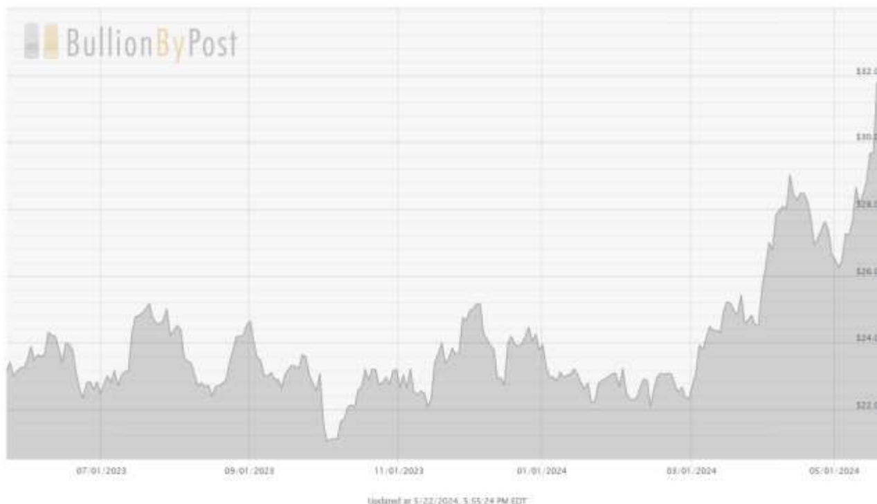
Chart: One-year rolling Silver price

For most commodities, supply and demand fundamentals dominate price behaviour, however this does not always apply to silver and gold because of their monetary qualities and reactions to macroeconomic factors. Although the price of silver can be strongly linked to gold, silver differs from gold in the fact that it is also considered to be an industrial metal and can also be linked to the performance of base metals production and industrial demand. That said a gold: silver divergence can emerge when the macroeconomic environment deteriorates, however because of its lower liquidity, silver can outperform gold in the event of a financial crisis. The gold to silver ratio as of the date of this MD&A is approximately 1:76 ounces, and ended the year approximately 1:87, with the 12-month high and rolling high of 1:91 on January 22, 2024 and a 2023 low of 1:76 ounces hit on May 22, 2024.