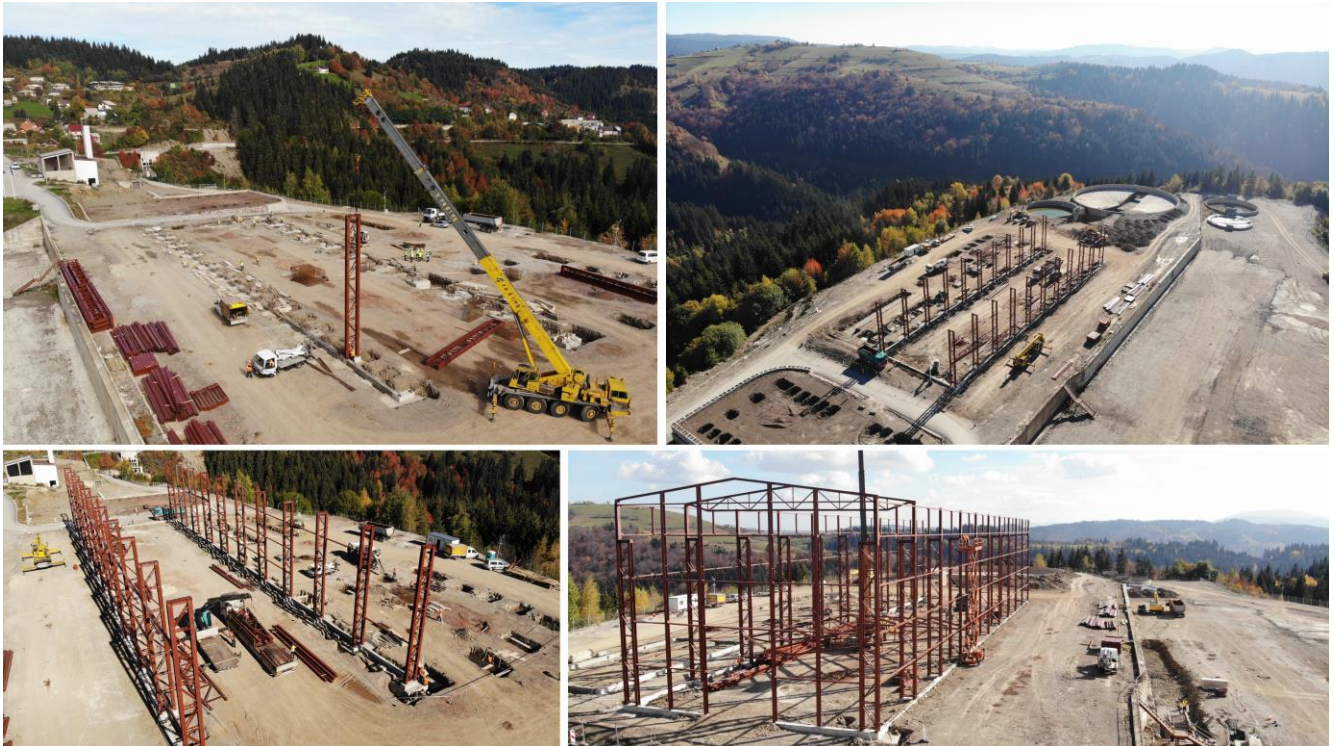
Figure 4: Vares Processing Plant Progress