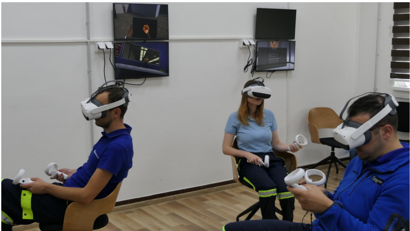
Figure 7: Virtual Reality H&S Training, Vares

The Adriatic team has commenced a safety training program using a purpose-built Virtual Reality training centre offering 13 different simulation modules. The Company has also commenced the development of a safety database to enable electronic workflows through smart tablets and phones, empowering both staff and contractors to report safety matters more efficiently and effectively.