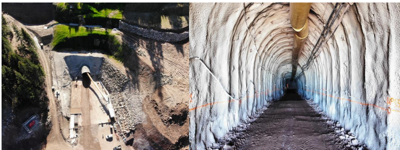
Figure 2: Upper Decline Portal and Underground Development

The Company remains on schedule to open its first stopes in Q2 2023, three months before commissioning of the Vares Processing Plant.