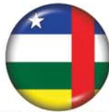
CENTRAL AFRICAN REP.