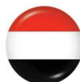
REPUBLIC OF YEMEN