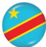
DEM. REP. CONGO