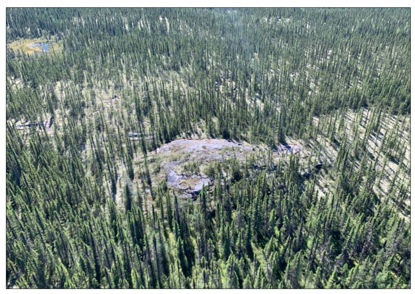
Figure 8 – The new Jamar Discovery outcrop viewed from the air.

• Multiple exceptional results up to 4.89% Li<sub>2</sub>O included<sup>5</sup>: