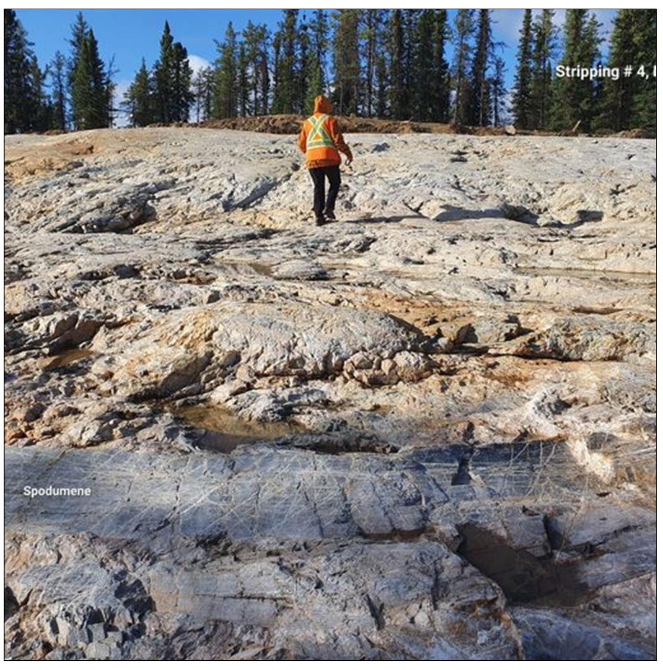
Figure 3: North view of the main dyke at Cancet showing spodumene crystals exposed during stripping.<sup>3</sup>