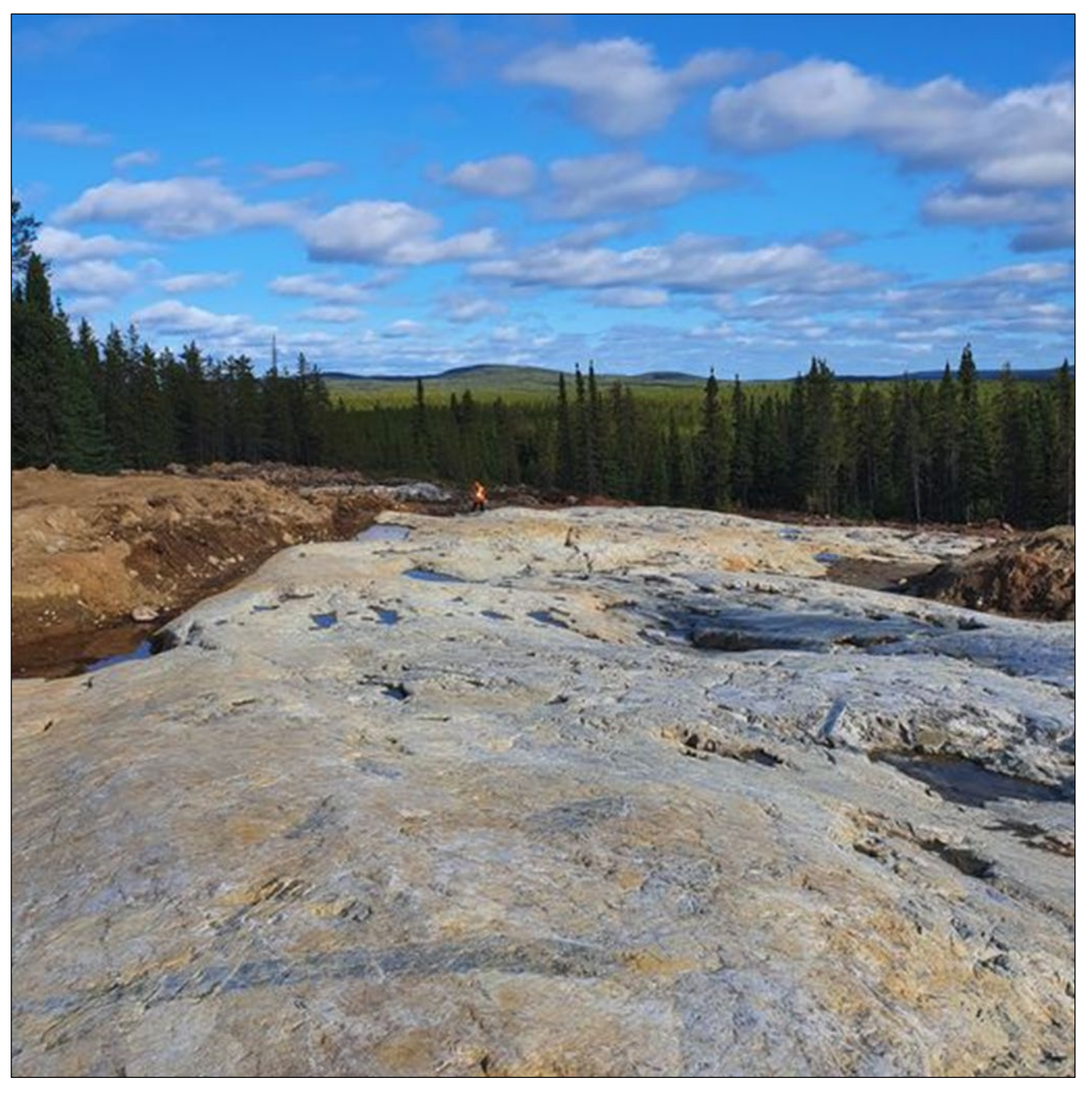
Figure 5: East view of the main dyke at Cancet showing spodumene crystals exposed during stripping.