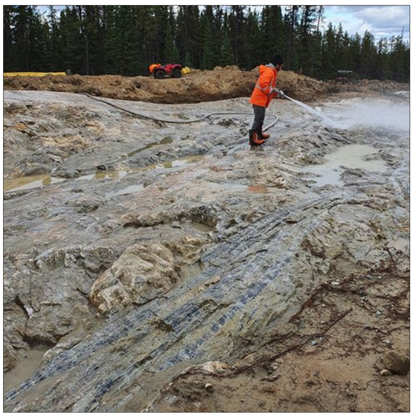
Figure 6: North-east view of the main dyke at Cancet showing spodumene crystals exposed during stripping.