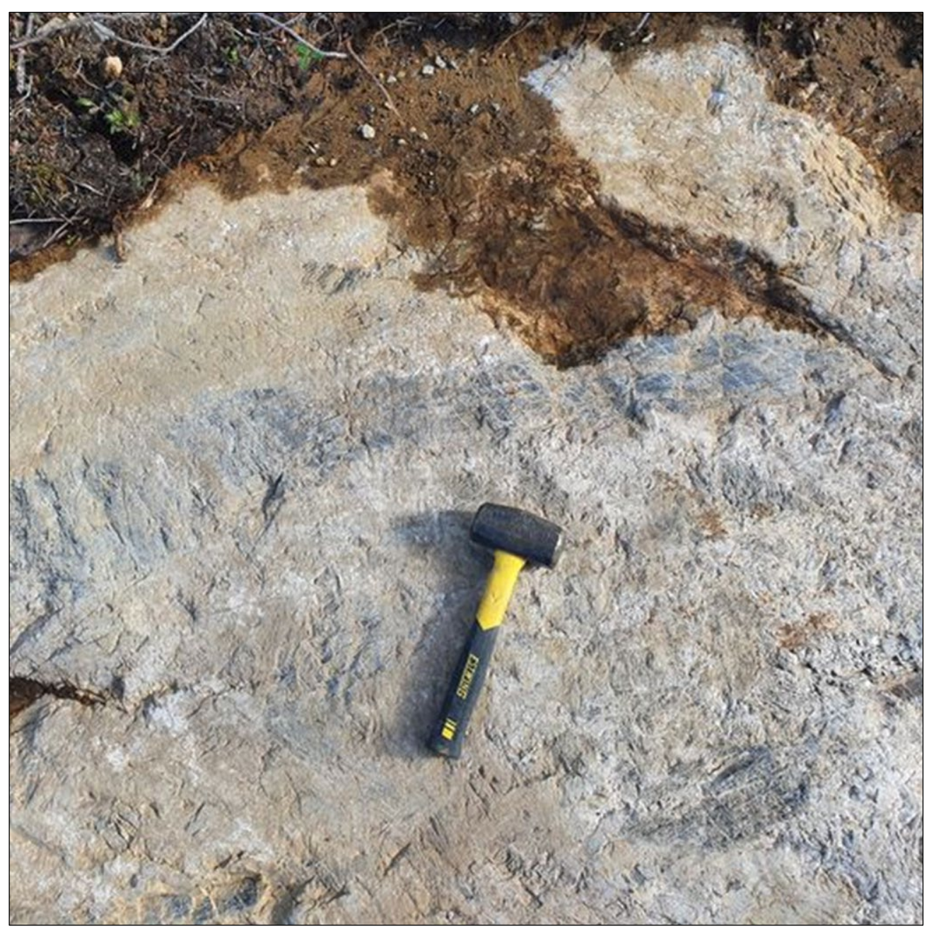
Figure 4: Spodumene crystals exposed during stripping of the Cancet main dyke.