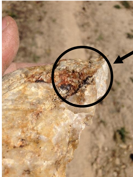
Visible Free Gold

The first stope was accessed and strongly iron-oxidized vein quartz material was removed from the stope where the early mining activity stopped. The following are pictures of a few of the samples that were recovered. The first photo shows a sample removed from the vein structure near the surface and it contained visible free gold.