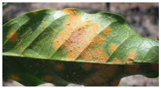
Coffee Rust is a fungus that turns the leaf yellow, and kills the coffee plant.

Hemileia vastatrix, or coffee leaf rust is a fungus that is devastating to coffee plant crops. Its prevalence increased in 2015 due to climate change, or global warming. The economic impact to the coffee industry is over 2.5 billion dollars since 2012, along with over 500,000 jobs lost in Central America, and an increase of illegal immigration to the USA. (Source: ICafe 2016. Forbes, "Coffee and the Press of Migration," Aug. 16, 2014).