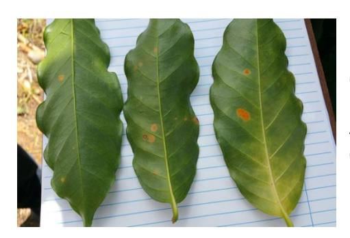
After 48 hours, comparison of coffee leaves attacked by the Rust. Treated or Not treated with CR-10. (Costa Rica, Fri. Feb. 19, 2016) See our video at <a href="http://bionovelus.com">http://bionovelus.com</a>

In 2015 and beginning of 2016, due to climate change, we see the magnitude of the epidemic. In Mexico and Central America coffee harvest have dropped their production between 30 to 80%.