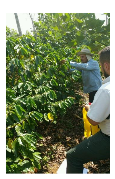
CoopeAgri Technicians counting and tagging the leaves affected by the rust for the Pilot Test.

The first results of CR-10 tests are a full success. CoopeAgri R.L. is excited by the results of CR-10. Once the pilot test is duly completed, we will spread the news to the other coffee cooperatives (72,000 coffee farmers on 93,000 hectares in Costa Rica) and other distributors that we have in our database.