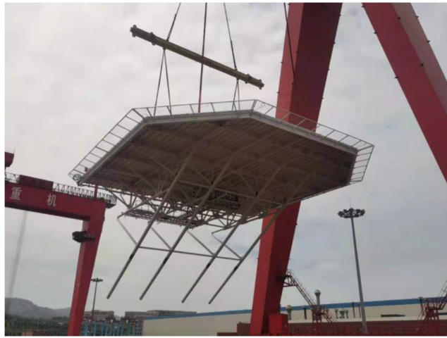
Platform helideck completed and ready for installation