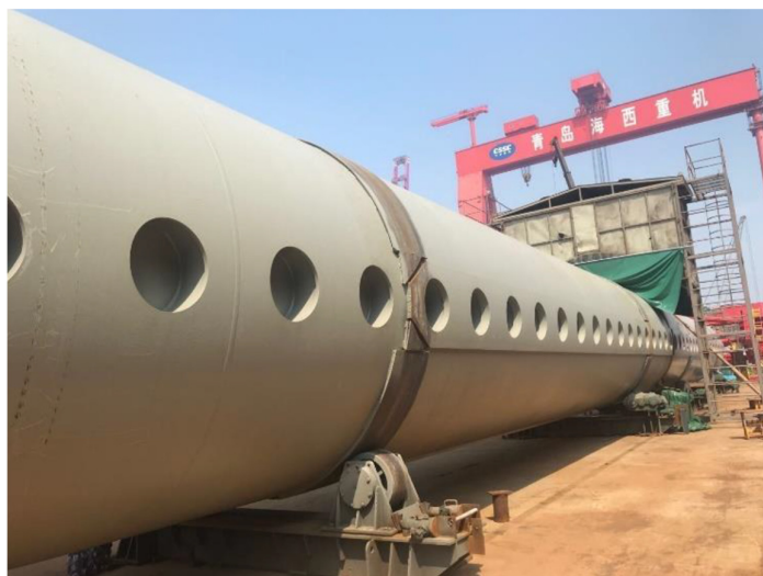
Platform legs completed and ready for connection