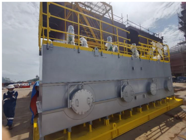
Production skid completed and ready for installation on the platform