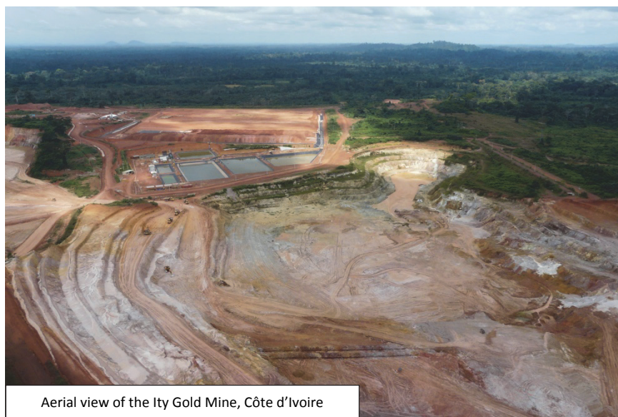
Aerial view of the Ity Gold Mine, Côte d'Ivoire