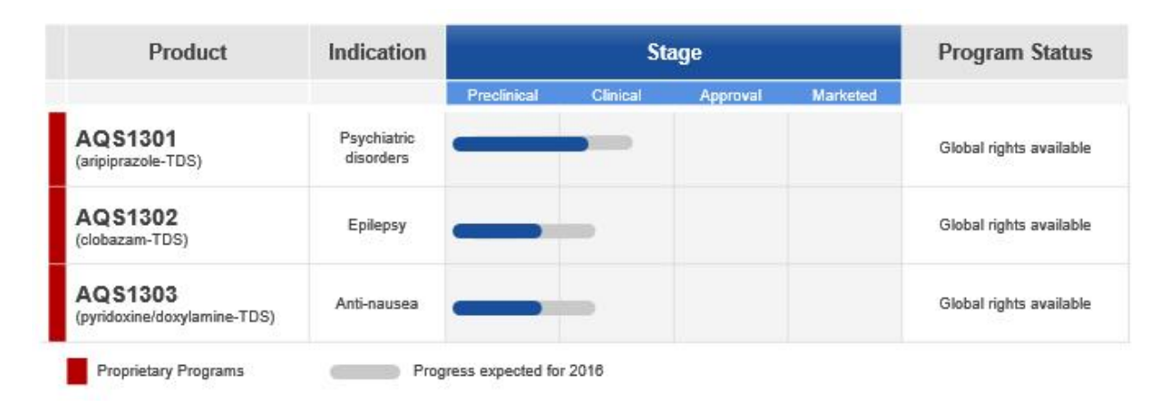
Figure 2. Aequus' Development Pipeline