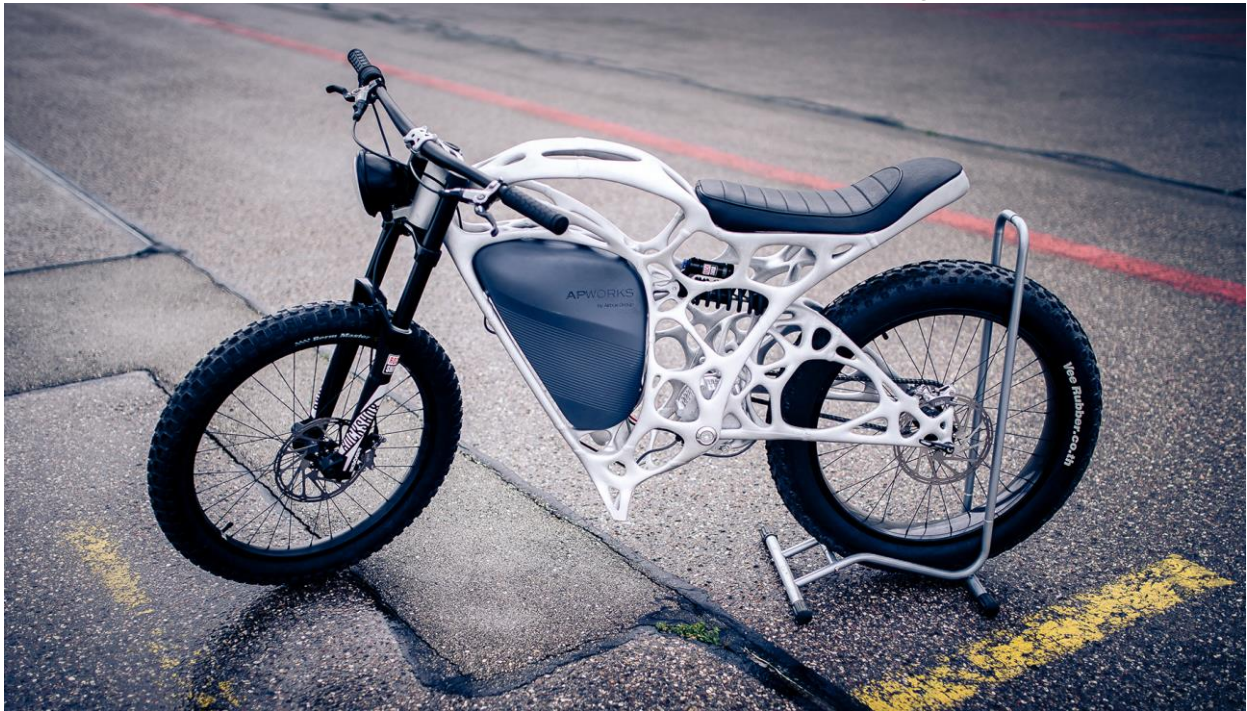
Figure 6: APWorks, a subsidiary of Airbus Group, has developed the Light Rider - a 3D printed Scalmalloy® (aluminium-magnesium-scandium alloy) electric motorbike which, weighing in at just 35 kg, is about 30% lighter than most conventional e-motorcycles. The Light Rider is capable of going from 0 to 80 km per hour in seconds and can travel close to 60 km between charges

The process of making 3D printing material involves the use of gas atomisation to convert the alloys into powders. The gas atomisation process inevitably produces some particles which are too fine or too coarse to be used in 3D printing. Currently, these undersize and oversize materials, containing highly valuable aluminium-scandium material, are being sent to waste, increasing the cost of the powder.