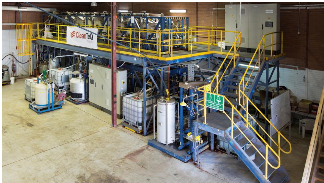
Figure 1: Clean TeQ's Proprietary Resin-In-Pulp (cRiP) Pilot Plant

The pilot campaign successfully processed a bulk sample of approximately 20 tonnes of Syerston ore to produce a batch of high purity nickel and cobalt sulphate eluate solution (see Figure 2 below). This solution is currently being further refined into samples of high purity nickel sulphate and cobalt sulphate which will be sent to potential offtake customers in the first quarter of 2017 for product testing and qualification.