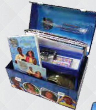
Collating, Kitting & Shrink Wrapping