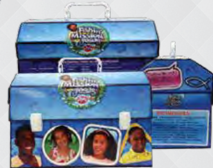
Bible Study Student Tackle Box