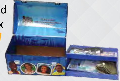
Custom Corrugated Tackle Box