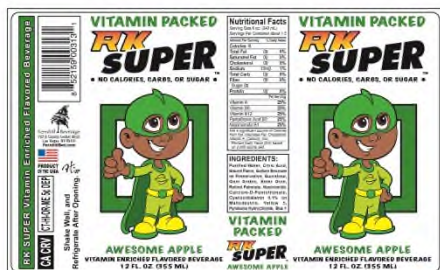
7(W) x 4.25(H)

The label features young children in cartoon form performing as Super Hero's. RS Super appeals to the Super Hero in all children. Fernhill Beverage has been working directly with National retailers to develop the correct marketing campaign necessary to promote and grow the brand.