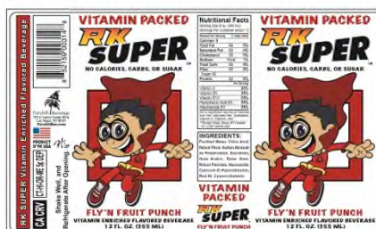
7(W) x 4.25(H)